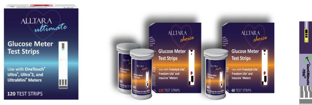
Alltara choice, and GenUltimate TBG is not yet available for sale or distribution in the United States or Puerto Rico.

Initial accounts were assigned to PARAGON for big box and private brand big box agreements include Walmart, CVS, Walgreens, Costco, Kroger and Cardinal Health. PARAGON will also work closely with us in evaluating other potential new retail product categories and products that we may launch in both branded and private label offerings in the future. Sadly, shareholders and non-shareholders have already attempted to contact PARAGON, one such incursion occurring during the writing of our 3Q 2019 Quarterly Report. The company has promised PARAGON that we will take legal action against these people should this activity continue. Instead we were notified that PARAGON contacted their own commerce lawyer and in addition verified the person (name, address, etc.) behind the incursion.